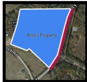
2715 Tyus-Carrollton Rd.